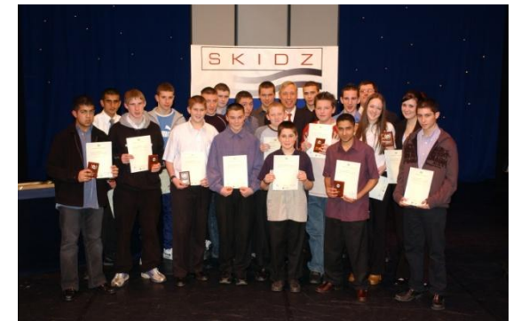
Successful students receive their certificates.

Parents – and teachers, can be assured the safety of students is foremost. ALL students wear overalls, boots and goggles when working on motors, are well supervised, and poor behaviour is not tolerated.